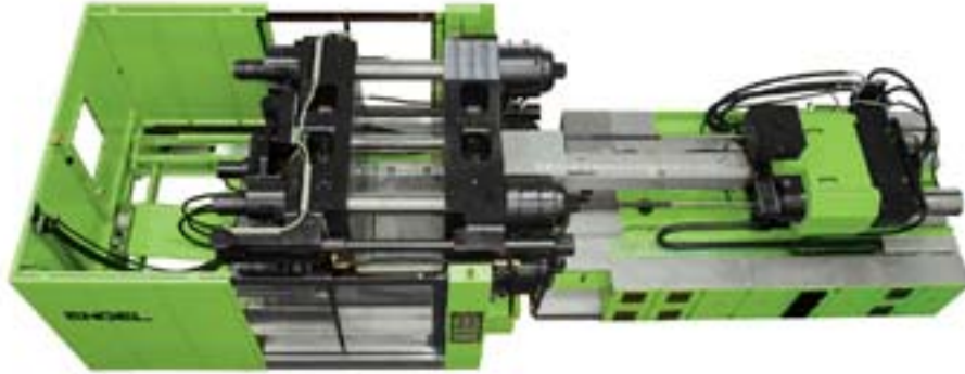
Picture 1. ENGEL offers the only two platen injection molding machine that has no contact with the tie bars, allowing frictionless movement to better control speed and precision.

precision. “As a result, we can achieve the necessary precision for running the combined process and achieving dimensionally accurate results, added Braig.”